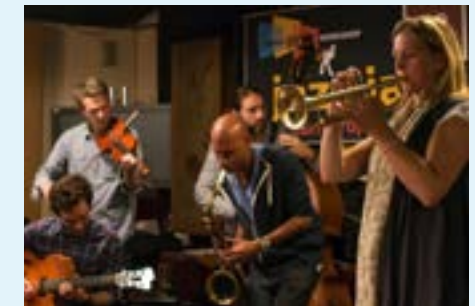
13 jam sessions at the Stanford Coffee House