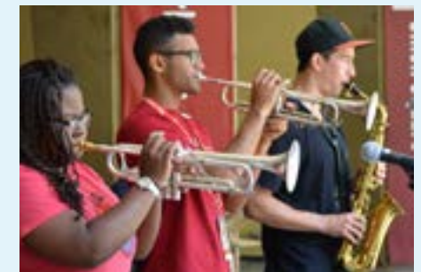
9 noontime concerts on White Plaza at Stanford