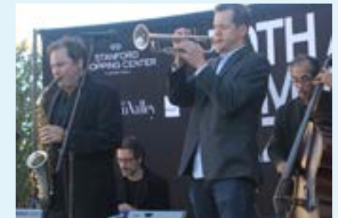
SJW Faculty All-Stars concert at Stanford Shopping Center

Additional performances featuring students and faculty, open to the public at no charge, attracted thousands of appreciative listeners.